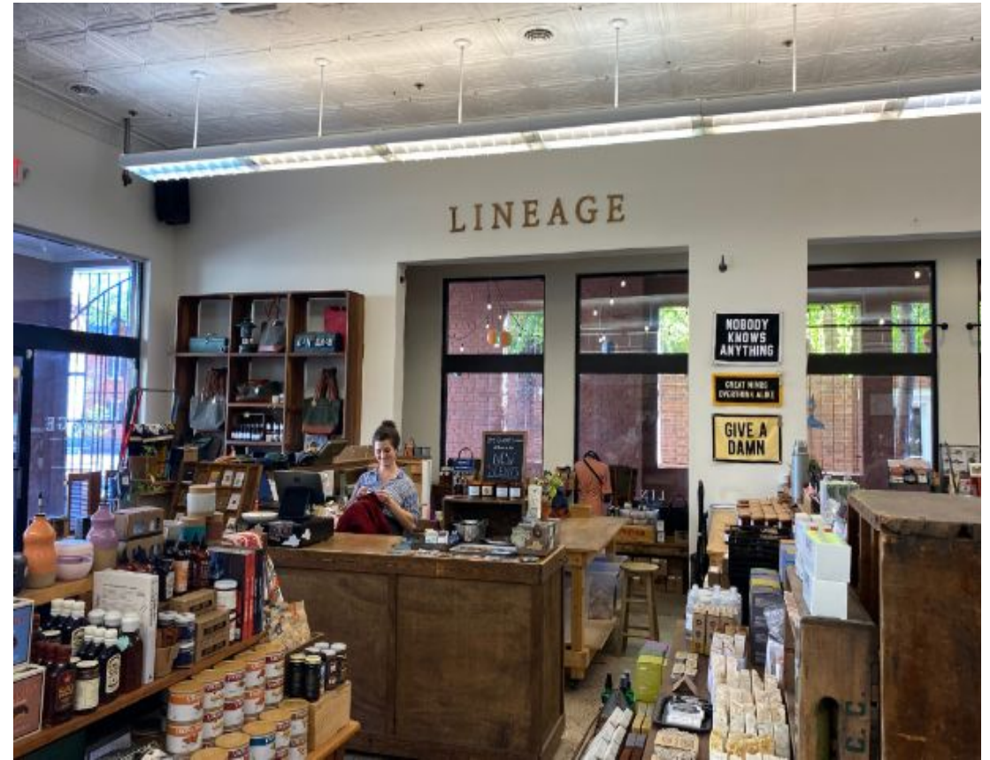
7 - Lineage