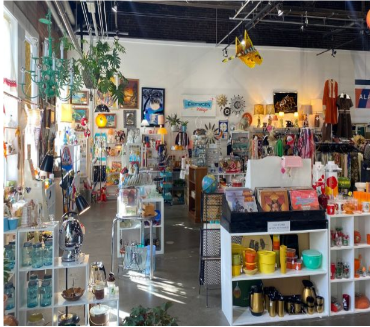
2 - Heartworn Vintage