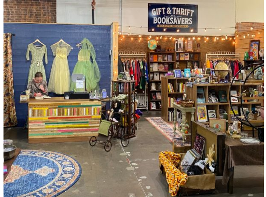
4 - Gift & Thrift and Booksavers