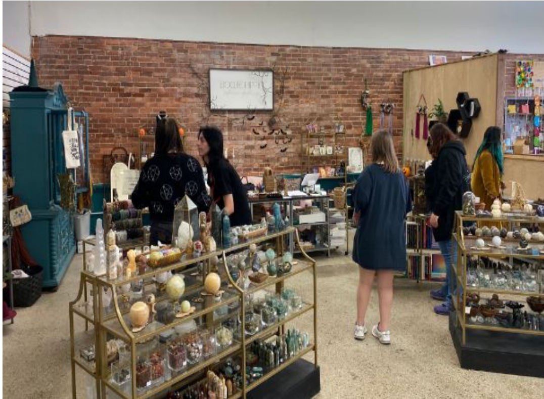
5 - Boujie Hippie