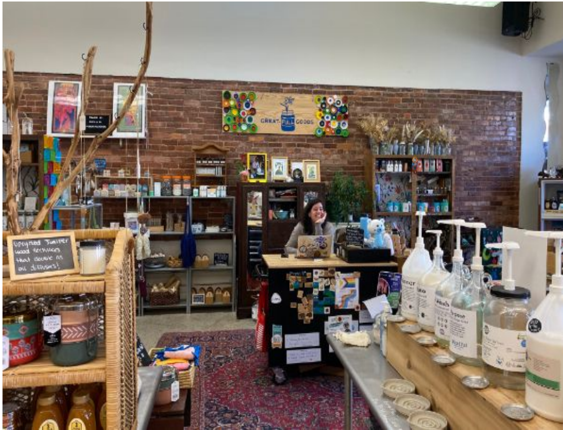
6 - Great.full Goods