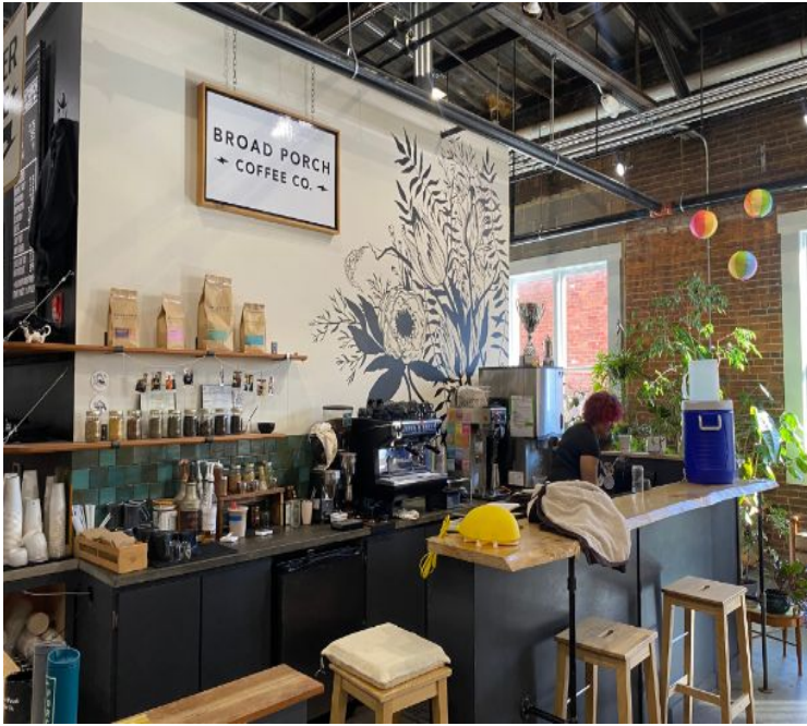
1 - Broad Porch Coffee

I get to visit 7 different locations to trick-or-treat.