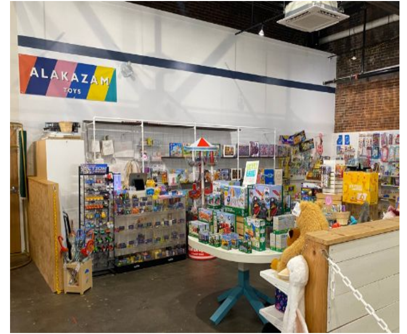
3 - Alakazam Toys